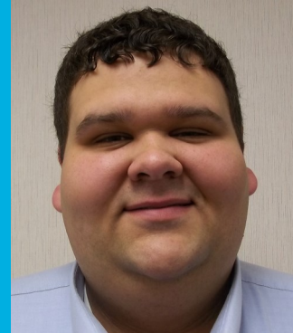
Landree Brotherton Best Western PLUS Morristown Conference Center Hotel