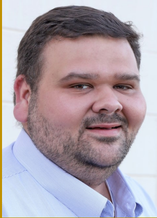
Landree Brotherton Wallace Distribution Co.