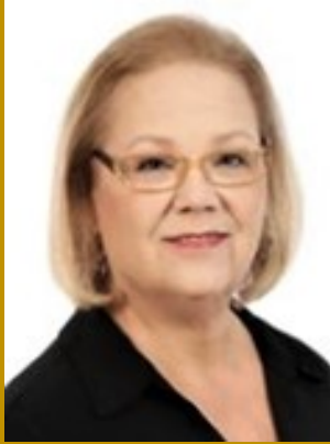
Norma Elkins Elite Realty