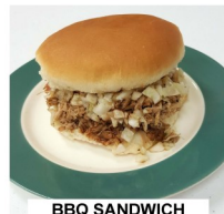
BBQ SANDWICH $5.00