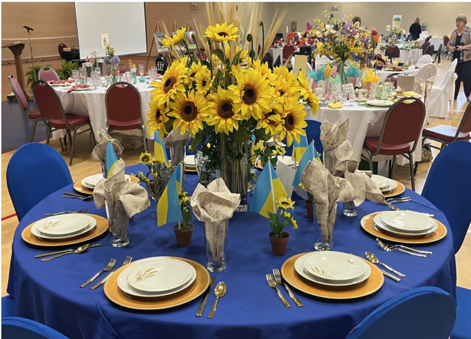
Table viewing at 4:30, dinner served at 6PM

at the First Presbyterian Church 600 West Main Street, Morristown