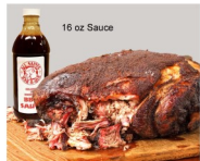
BBQ BUTT or 4 One Pound Packs $44.00