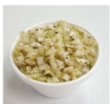
SLAW 16 oz $3.00