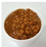
BEANS 16 oz $3.00