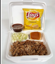
PLATE LUNCH $8.00

May 12, 2023 PICKUP 10:30 am - 1:30 pm (423) 586-6201