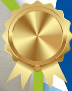
Becky Hodge FIRST FIRE TRUCK FUND